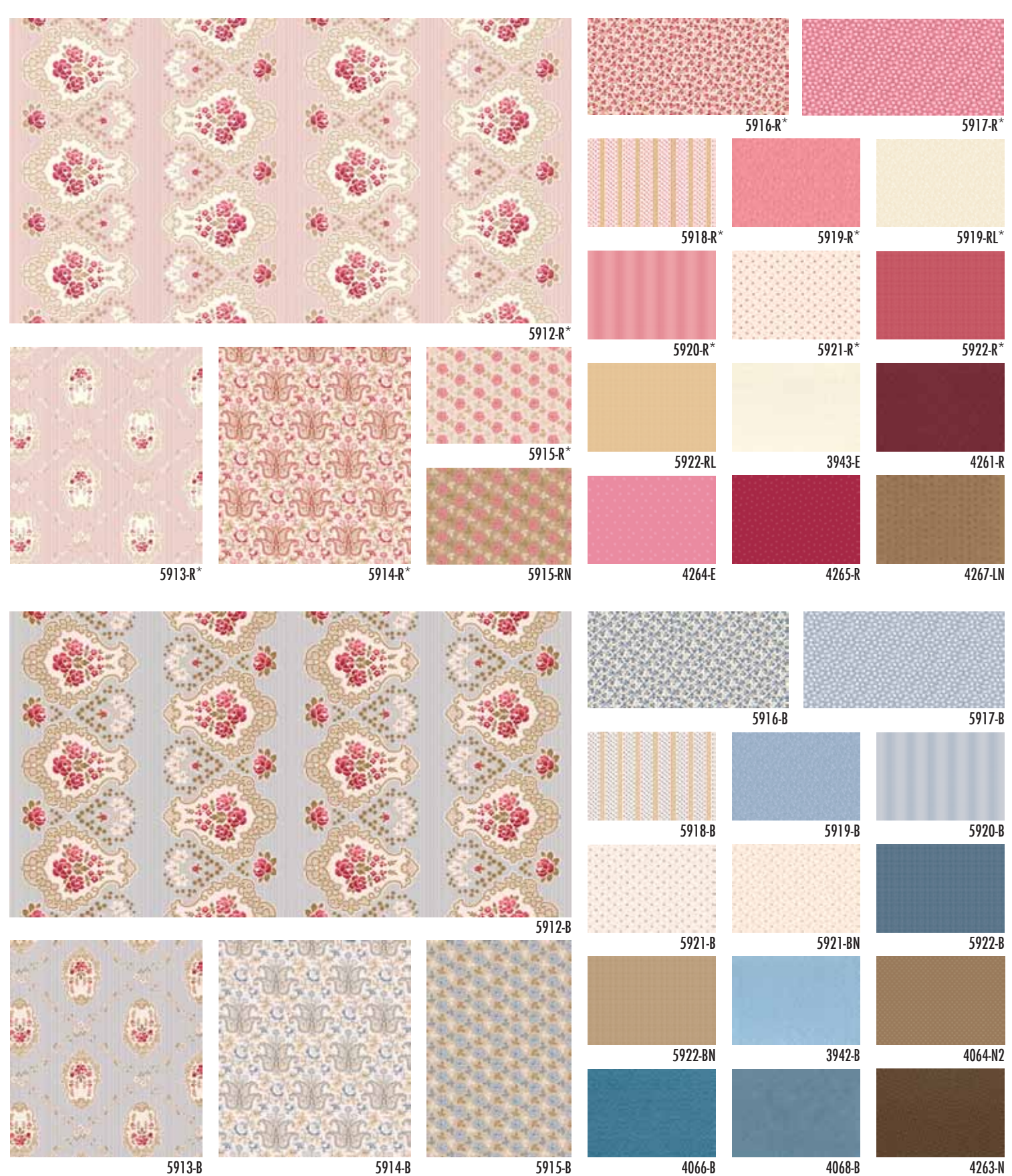
*Indicates fabric used in quilt pattern. Fabrics shown are 10% of actual size.